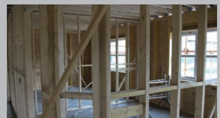
Rectory Road, Lurgan