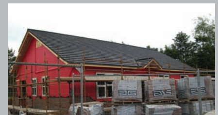
Rectory Road, Lurgan

The families who have been pre-allocated these special needs bungalows have been on the waiting list for several years, so will be very pleased when they are complete. These special needs bungalows are being built to Code Level 3 of Sustainable Homes and Secured by Design.