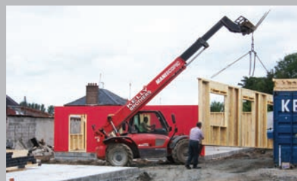
Annaghdale Place, Portadown

Work on site is progressing very satisfactorily at Rectory Road and Annaghdale Place. The site at Garvaghy Road will commence as soon as an agreement has been made with the owner of the land adjacent to our site. The use of the land will enable the contractor to provide adequate storage and welfare facilities for his work force.