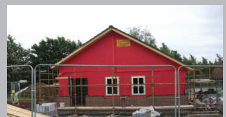
Rectory Road, Lurgan